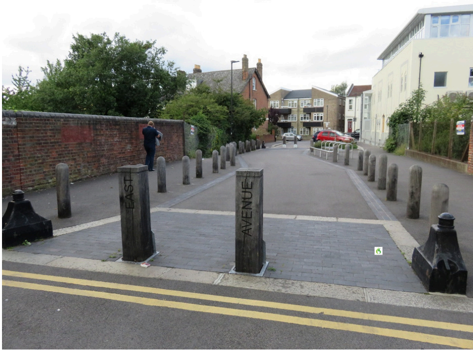
Figure 1: Modal filter in the London borough of Waltham Forest (Rachel Aldred)

2020). Our primary outcome was number of casualties of any severity, both in total and by casualty mode of travel. We present secondary analyses examining killed or seriously injured (KSI).