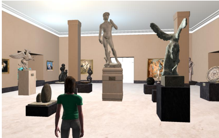
Figure2. A screenshot of the virtual gallery in REVERIE.

The second educational scenario is a virtual gallery with 3D reconstructed objects (see Figure 2) representing various historical eras. This scenario is a virtual gallery competition, where students have to search the virtual gallery, find objects assigned by the teacher and talk about them with the aim to convince their fellow students and teacher about the importance of the object. Specifically, once they are all in the virtual gallery, the teacher shares with each student a card containing information and a number of questions to consider in their presentations (e.g., when was the object made, why is it important?) about a random object in the gallery. The student has to walk around the world, closely observe the exhibits in order to find the object. Once the student finds the object, s/he needs to guide the rest of the group by providing navigation instructions using the spatial audio features around the object so the presentation can begin. Once the student is ready, s/he must enter the name of the object on the REVERIE GUI and start presenting.