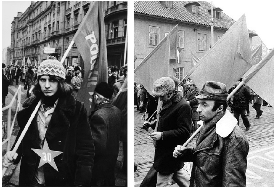
F3 and F4. Prague, 1978.