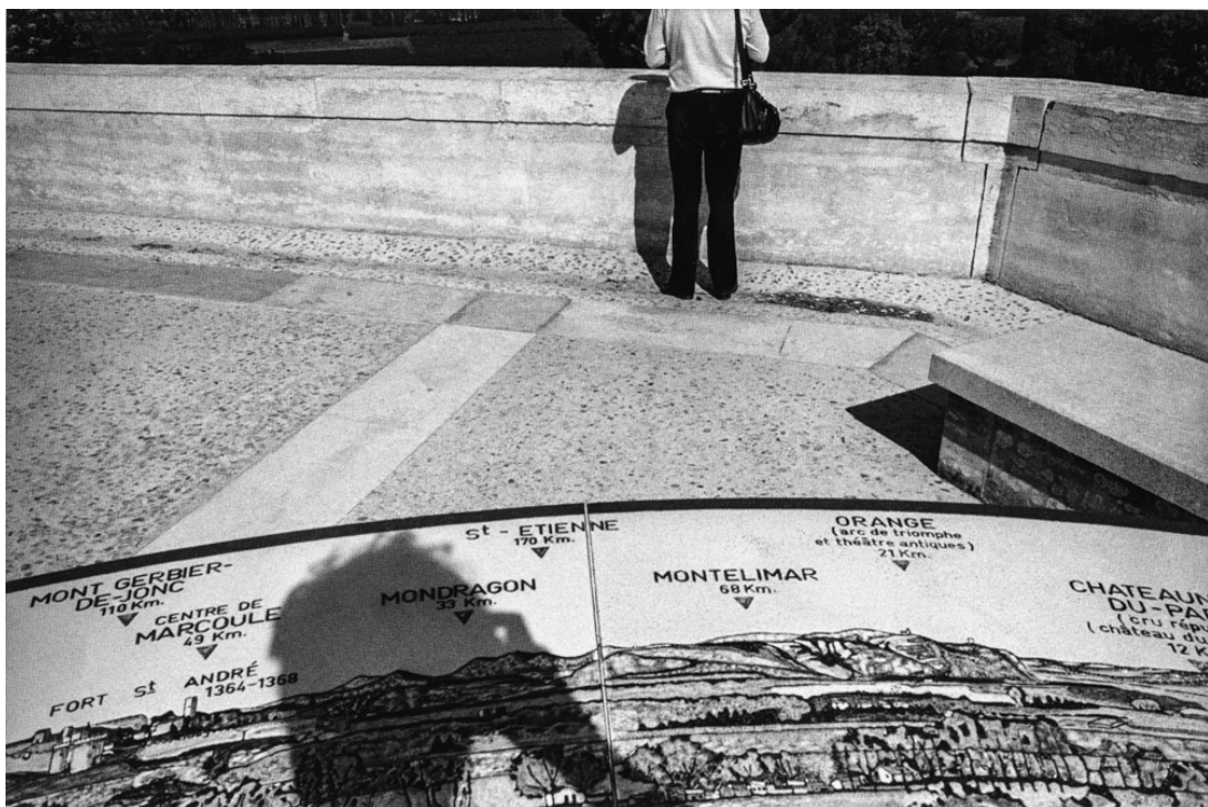
F6. Provence , 1980. Photograph by Vladimír Birgus. ©Vladimír Birgus.

us backwards or too distant from the camera to offer any relevant gesture. What does seem to matter the most is the geometric relation between the different forms and the delicate balance among their volumes. It is precisely here, in the tensions between the few minimal, but carefully chosen elements, that the scene becomes highly psychological. The characters, deprived from their subjectivity, are relegated from reality and placed under a secondary dimension where only Birgus - and his grey matter - belong. He seems to trigger precisely that point of the viewer's consciousness that can make us deeply affected by the oddness of his parallel, phantasmagorical world.