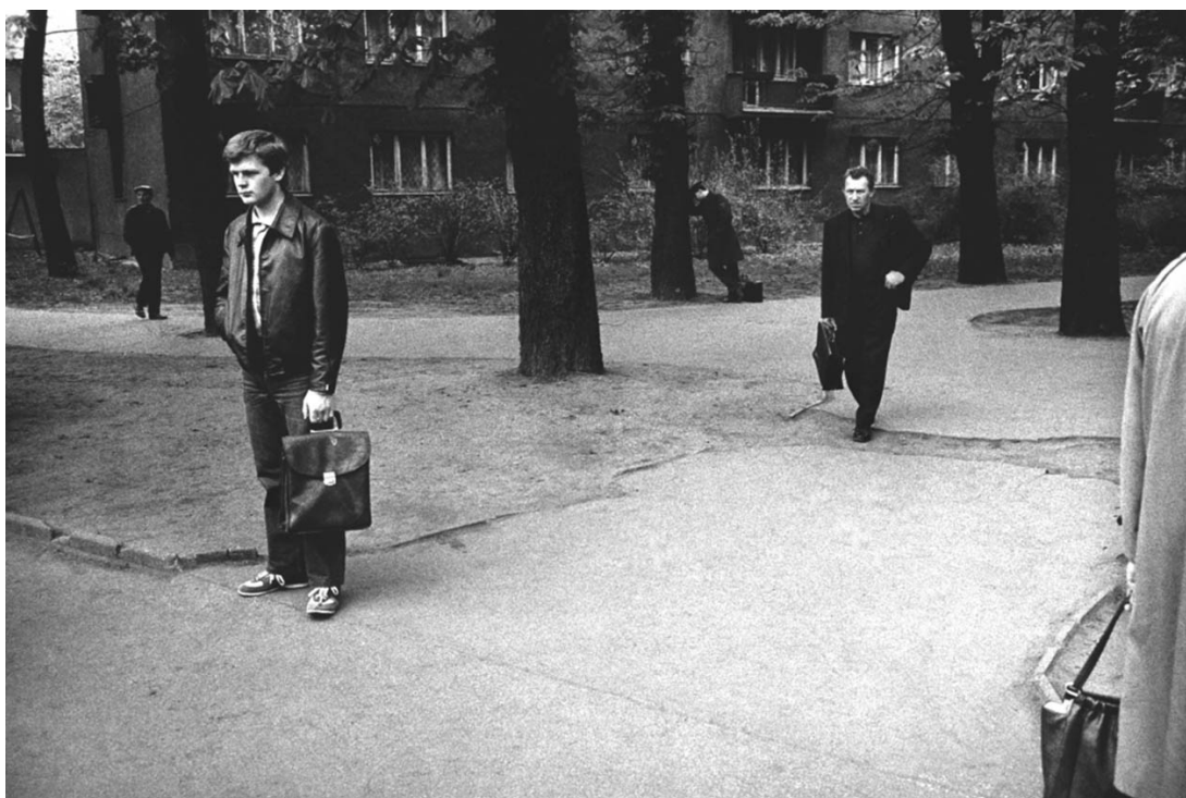
F1. 'Untitled', from the series Ostrava , 1984. Photograph by Viktor Kolář. © Viktor Kolář