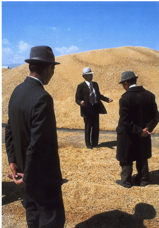
F7. Kyrgyzstan , 1981.

relevance with the forms and volumes of objects depicted (F7). This chromatic experience removes every trace of narrative from his work, it dominates the image, setting up the psychological mood of each scene from an abstract perspective. The different tonalities immerse the sitters in a world filled with confusion and disorientation, which pushes them further away from reality and leaves the viewer wondering about the ‘probability’ of such visual effect.