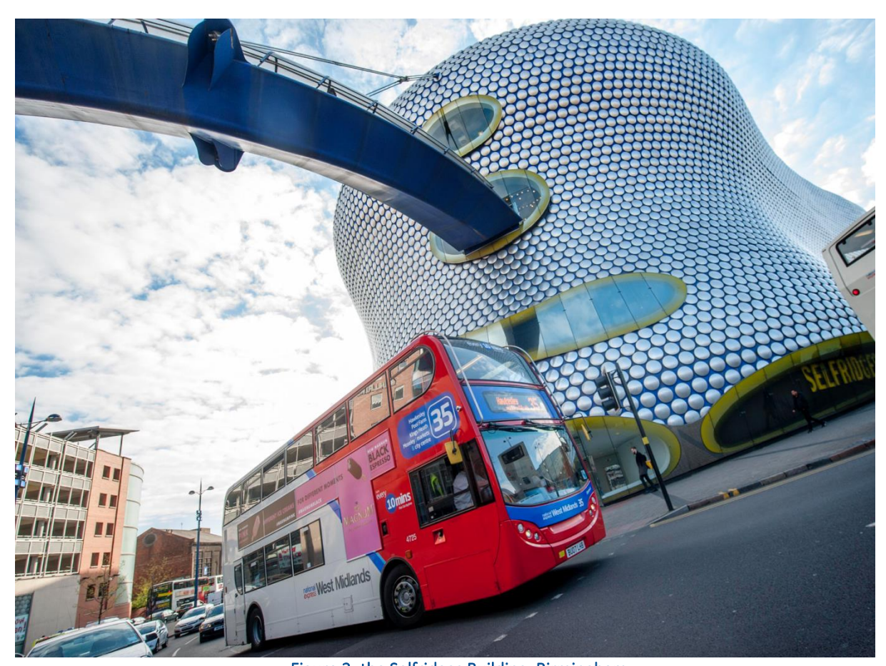
Figure 2: the Selfridges Building, Birmingham