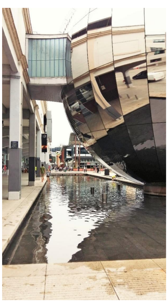
Figure 3: At-Bristol Planetarium

the city is expected to increase its population by over 20% by the end of the 2020s (Hudson 2013). Bristol's smart city ambitions risk being side-lined if the city becomes a 'London lite': a city that is not only expensive but unaffordable, where transport and mobility is slow and costly, and where the poor and low-paid are increasingly side-lined and excluded from the glittering visions of Bristol as a 'smart' capital for the South-West