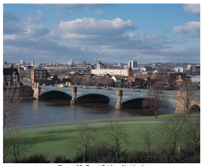
Figure 12: Trent Bridge, Nottingham

economic growth and the case for city devolution" (Core Cities nd). Nevertheless, it has not featured prominently on the international landscape of 'smart' urban innovation. This may well change in future: it was recently named one of the UK's 'top ten' smart cities in a recent report commissioned by Huawei (Woods et al. 2016). Though not positioned among the 'leaders' in this report, Nottingham was bracketed with Sheffield as a 'contender' city, which has developed a smart vision and has begun to implement some significant specific activities.