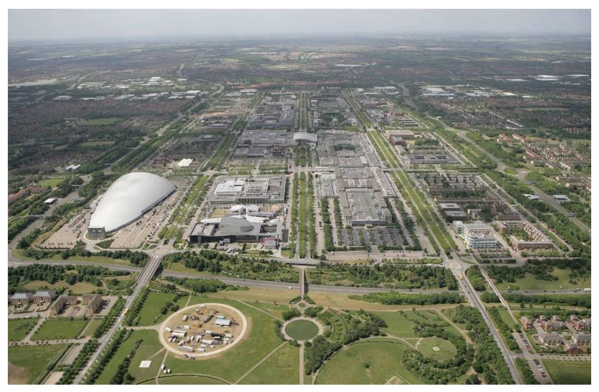
Figure 10 Central Milton Keynes Source: Green Digital Charter

http://www.greendigitalcharter.eu/wp-content/uploads/2012/10/Milton-Keynes.jpg