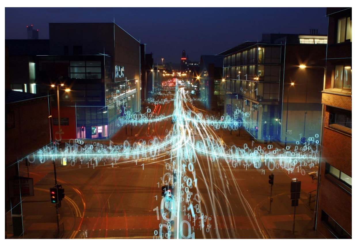
Figure 9: Oxford Road, Manchester

that will lead the way in developing more smart green cities in China, while also fostering UK-China cooperation and opening up business opportunities for UK SMEs" (UK-China Smartcities nd a).