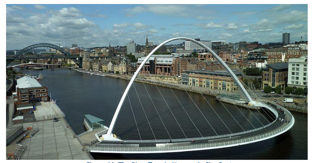
Figure 11: The River Tyne in Newcastle City Centre

from the decline of heavy industry, but has made efforts to promote itself as a centre for hi-tech and low-carbon industries. Policies and promotional materials relating both to the Science Central project and the broader economic strategies for the city region mobilise a narrative of continuity with, but transformation of, the city's industrial heritage. The symbolic charge of Science Central being developed on the site of a brewery and a nineteenth-century coal mine is exploited in the documentation.