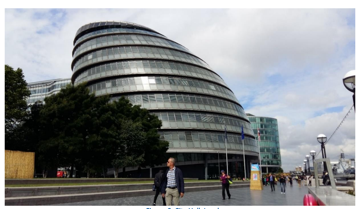
Figure 6: City Hall, London

- relating to infrastructure, services and governance – for which consequently diverse 'smart' solutions need to be found. The latter are predicated on exploiting the benefits of open data and digital technology to address governance complexity and enhance socio-economic and environmental innovation.