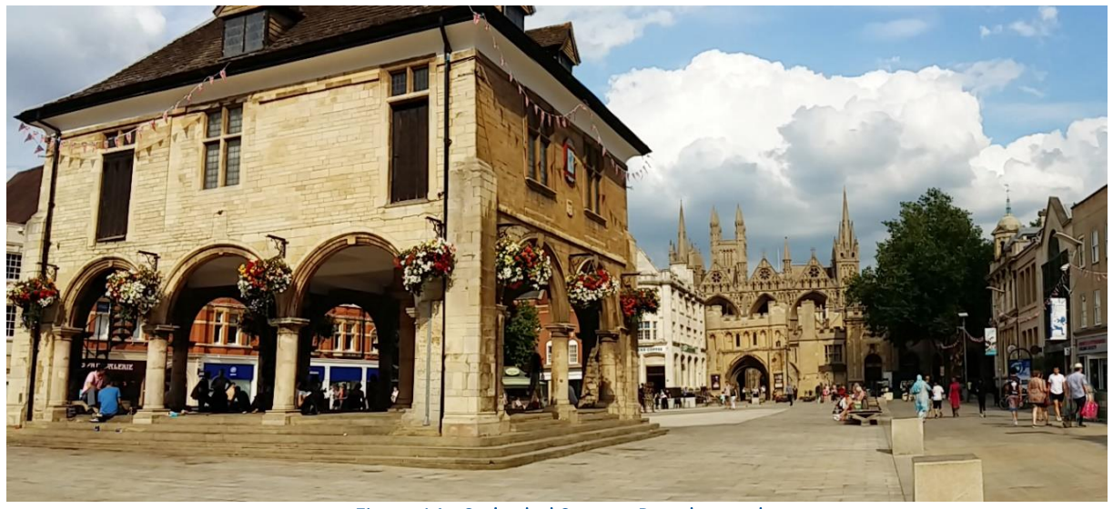
Figure 14: Cathedral Square, Peterborough

2012-13, Peterborough came second and was awarded £3 million to develop the Peterborough DNA project (see details below). Peterborough was also awarded the Smart City of the Year 2015 award at the World Smart City Congress held in Barcelona in late 2015, coming top of a list of 265 cities (Opportunity Peterborough 2015). In the competition, Peterborough was ranked higher than global contenders such as Dubai, and higher than other UK entries. On the UK smart cities map, Peterborough is widely ranked higher than Cambridge, its more academic rival and neighbour.