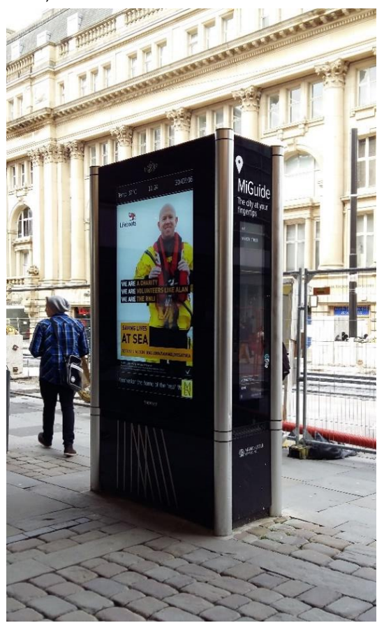
Figure 8: one of the MiGuide digital information points in Manchester City Centre

Flow Energy Systems' project to support electric vehicles at Manchester Science Park, and the 'MiGuide' digital street wayfinding service currently operational in the city centre. Its embrace of 'New Technologies' (Manchester City Council, 2016a), exemplified by "sensors, LED lighting, smart ticketing, or low carbon technology such as electric vehicles or solar panels" (Manchester City Council 2016a), is complemented by the principle of 'New Ways of Working' (integrating systems, exploiting big data to manage the city in real time, and providing better information for residents, workers and policy-makers).