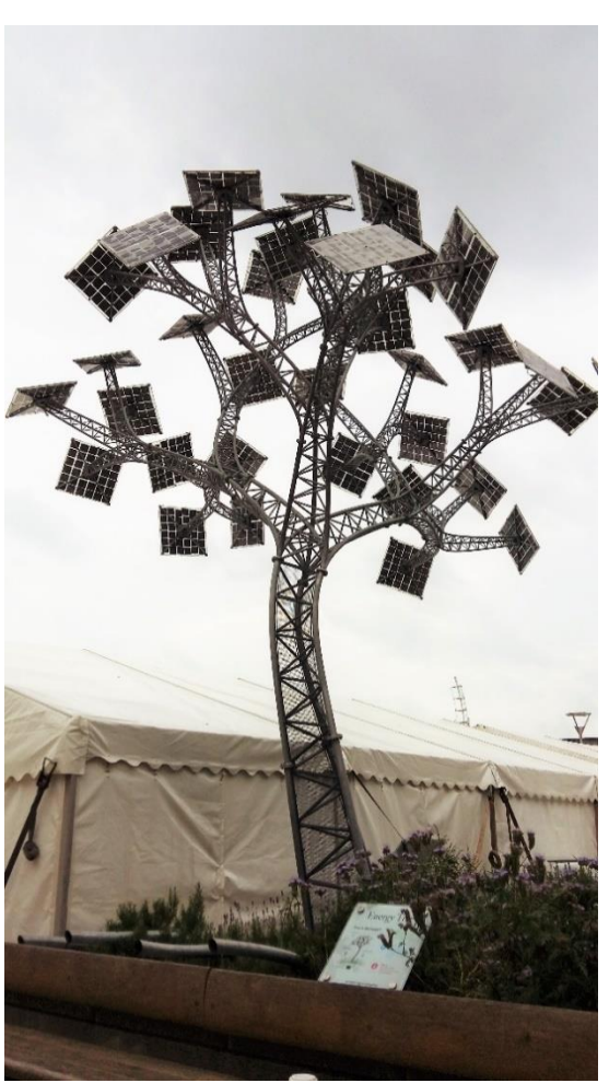
Figure 4: Energy Tree, Millennium Square, Bristol