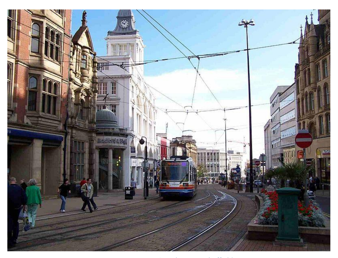
Figure 15: Tram & High Street, Sheffield