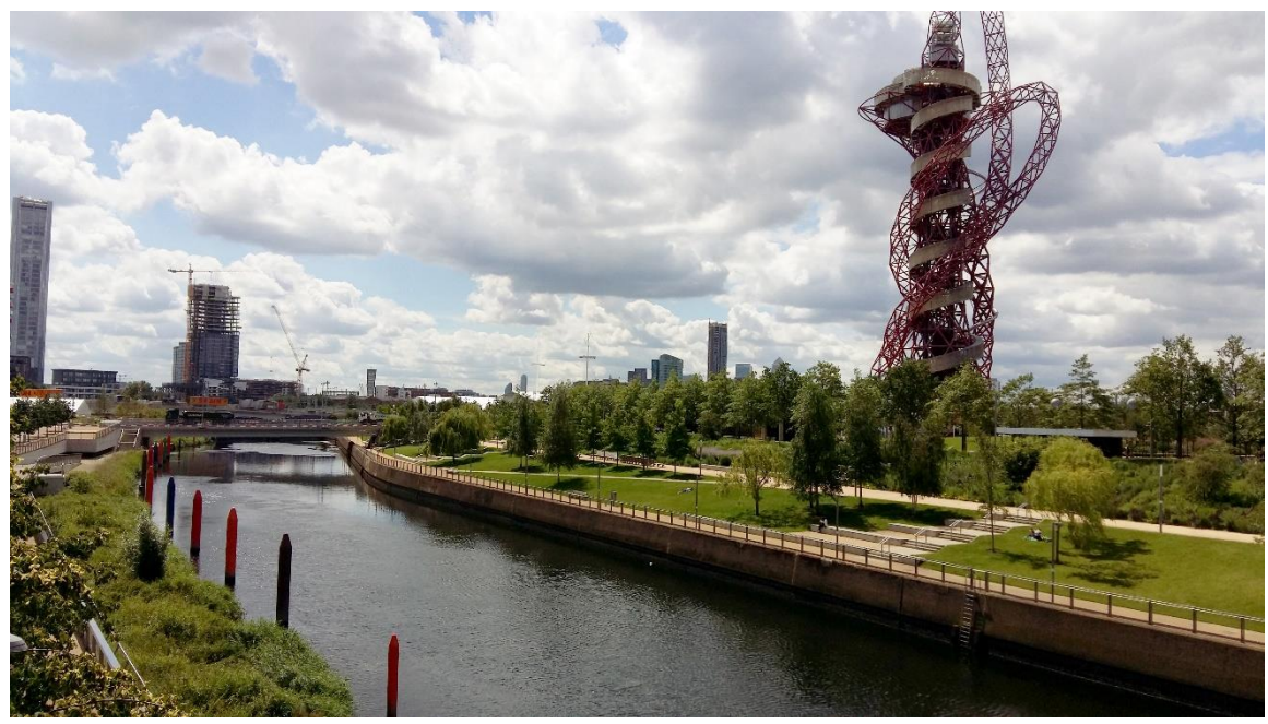
Figure 7: Queen Elizabeth Olympic Park

growth through digital technological innovation and governance is, then, also reflected in the various pilot initiatives and programmes put in place to implement the strategy. For example, the Talk London initiative recently featured a discussion forum on London's housing crisis and related policies aimed at increasing the number of houses built; another discussion strand engages with strategies and initiatives for local regeneration. The latter has also been a focus of the Civic Crowdfunding pilot programme, which emphasises support for unique, bottom-up making initiatives. such place parkland, and regenerating turning brownfield land into organic urban farms.