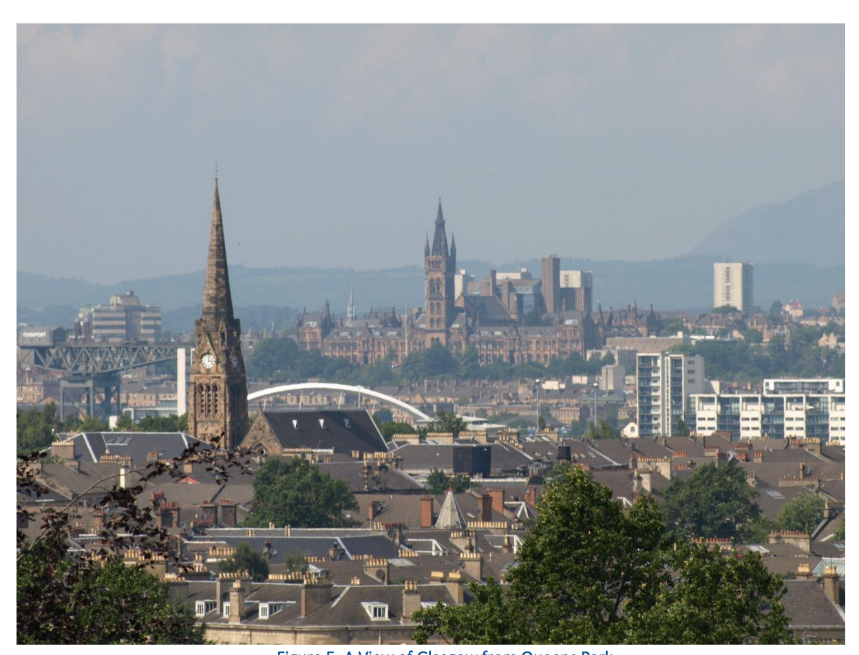
Figure 5: A View of Glasgow from Queens Park

their assumptions on the power of data to provide opportunities for business, and to improve governance because of better collaboration. Nevertheless, entrepreneurs and other users of data are largely silent in these core strategic documents.