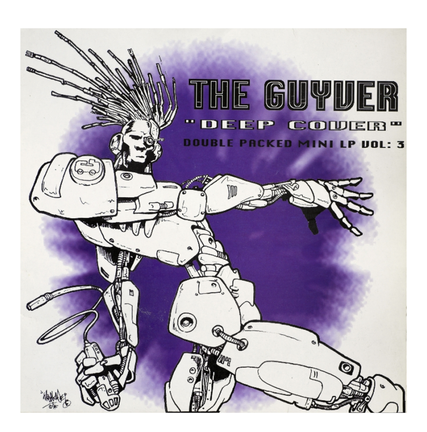
Figure 2: Deep Cover mini LP by The Guyver (1995)

enhanced by electromechanical devices that disrupt the boundary between nature and technology" (2011: 191).<sup>4</sup> The record sleeve for the Deep Cover mini LP by The Guyver (Reinforced 1995) dramatically articulates this boundary disruption in the form of a dreadlocked cyborg MC, thereby reframing the familiar figure (at least to Londoners) of the urban Rastafarian in a futuristic context (see fig. 2). This fascination with the cyborg can be seen to have developed out of a sense of paranoia about the post-industrial displacement of human labour by cybernetics and information technologies, and the political and corporate power structures that seem to legitimate their destructive social effects in urban environments. In this context, drum 'n' bass culture transforms dub's visual iconography to construct the future as "dread time".