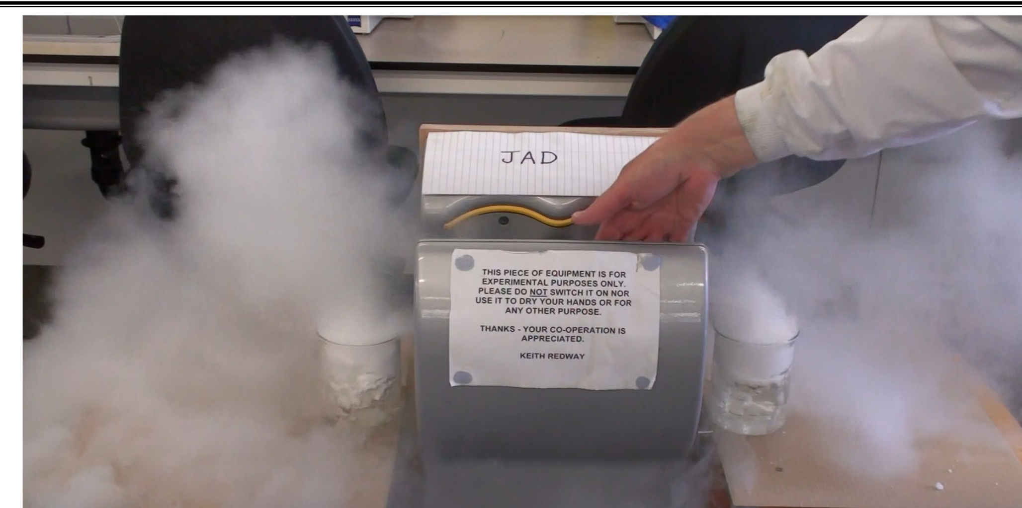
Figure 3: Visualization of the air flow from a jet air dryer.

The jet air dryer was shown to produce significantly more dispersal of virus from the hands than the warm air dryer or paper towels. After use of the jet air dryer, high numbers of virus were detected at a range of heights with maximum numbers between 0.61 and 1.22 metres. Virus was also detected at distances of up to 3 metres from the jet air dryer and in the air for up to 15 minutes after its use with exponential decline in number. The warm air dryer and paper towel dispenser produced lower viral counts at different heights, different distances and times after use. The visualization (Figure 3) shown below of the air flow from a jet air dryer helps explain the results of this study. Claimed air speeds for jet air dryers of over 600 kph are likely to increase the risk of transmission of viruses from the hands of users to other occupants of public washrooms.