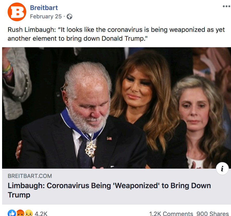
Figure 3: Breitbart's spreading of Rush Limbaugh's coronavirus conspiracy on social media, https://www.facebook.com/Breitbart/posts/rush-limbaugh-it-looks-like-the-coronavirus-is-being-weaponized-as-yet-another-e/10164646988865354/ , accessed on 28 March 2020

The example of Rush Limbaugh's conspiracy claim that China manufactured coronavirus in order to bring down Donald Trump shows how the far-right uses a combination of different media in order to spread false news in the public. In this particular case, the broadcast medium of radio was used in order to launch a false news story. Breitbart used the Internet and social media in order to amplify the false news story. Broadcast media and social media that allow commenting and sharing together amplified the audience reach and thereby the spread of coronavirus false news.