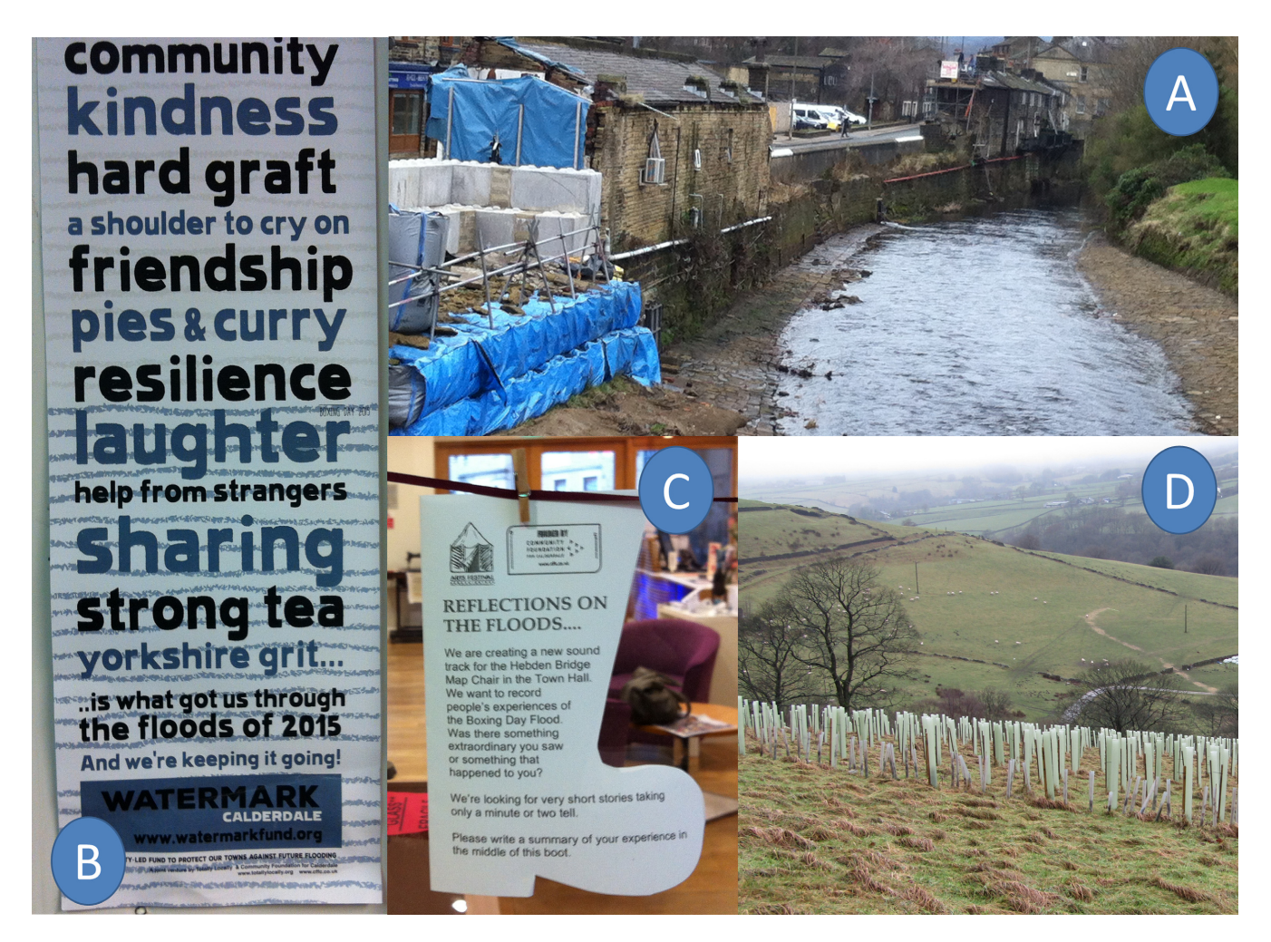
FIGURE 2 (a) The floods did considerable damage to the buildings and roads in Mytholmroyd. (b) Watermark poster with words describing the 2015 floods. (c) Reminder of the 2015 floods. (d) Tree-planting on a slope.

There was evidence of NGOs (e.g., Treesponsibility) contributing to pro-action measures regarding changes to spatial planning. The NGO was involved in small-scale nature-based approaches, such as tree-planting, thereby contributing to flood