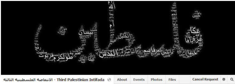
Open Group 11,570 members سأنتفضها على حين الفخذ عنقوساً ... من لنا يعضون فلسطينيين لئلا نمناساً Third Intifada Facebook group, an offshoot of the March 15 mobilizations, generated thousands of followers. (Screenshot from May 2013, courtesy of activists)