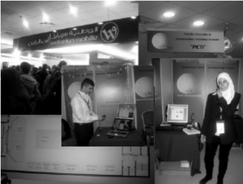
Collage of Expotech 2009.

deepening economic power of a small business elite within the context of global capitalism. This is why we refer to the politics of the internet under Israeli colonialism as “cyber-colonialism.”