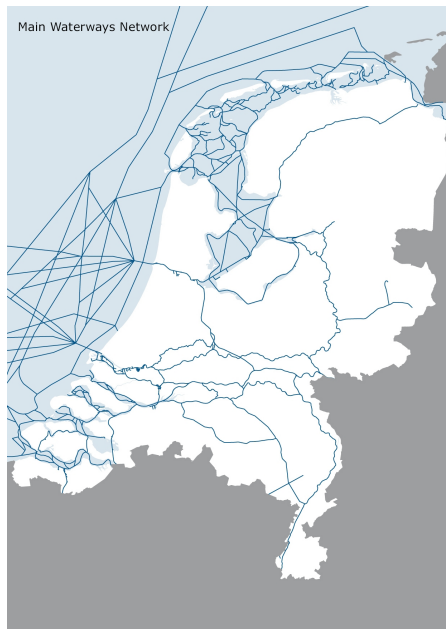
Figure 4 Main waterway network of the Netherlands

Infrastructure and the Environment. The Ministry is responsible for initiating, budgeting and preparing information on prioritization of navigation projects. Rijkswaterstaat is assigned to advise, prepare and implement these projects. Funding for projects comes from the treasurer and usually covers the entire cost of a project. In 1815 at the Conference of Vienna, it was decided that major waterways in the countries along the Rhine river had to be free of toll and obstacles. This agreement still stands and implies that users of waterways should not be charged for use of the system in any sense. The network that falls under the responsibility of Rijkswaterstaat is a mix of adapted rivers and artificial canals (Figure 4).