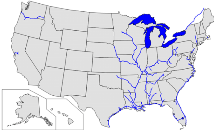
Figure 3 Main waterway network of the US

The network under the responsibility of the Corps is around 19,200 km in length (Figure 3). By law, a local partner must be found to carry the burden of part of the expense of any waterway project to secure federal support. These expenses can be monetary or in kind.