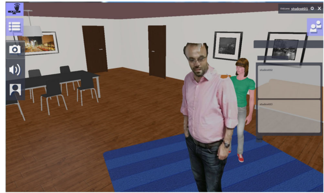
Fig. 3 REVERIE virtual hangout scenario session with replicants

The most realistic human representation is achieved in REVERIE by means of "replicants". By replicants, we refer to a dynamic full-body 3D reconstruction of the user. The REVERIE visual "Capturing" module is responsible for capturing a user during a live session with the use of multiple depth-sensing devices (Kinects) and dynamically reconstructing a 3D representation of the user (including both 3D geometry and texture) in real time. The user moves inside a restricted area, surrounded by at least three Kinect devices, while standing in front of the display interacting with other participants. The "replicant" reconstruction is coded in real time and transmitted in order to be visualized on other users' displays along with the elements of the shared virtual world, see Fig. 3. Alexiadis et al. [22] discuss in detail the reconstruction module's pipeline for capturing and 3D reconstruction of replicants.