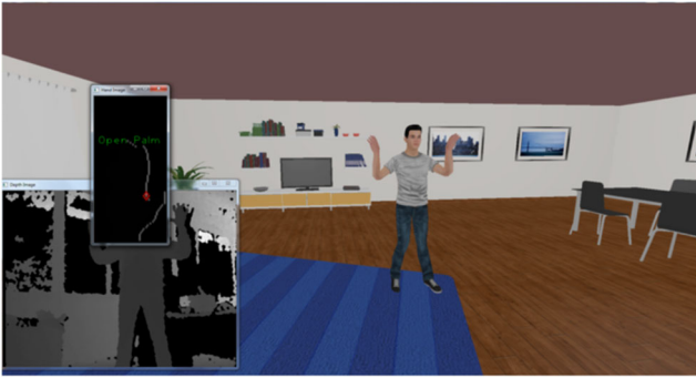
Fig. 2 Kinect Body-Puppeted avatar shown in the 3D Hangout environment using the Kinect gesture-driven navigation module via Kinect skeleton resource sharing offered by the Shared Skeleton common module