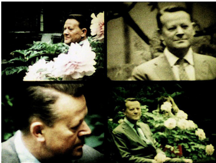
Prime Minister Jens Otto Krag.

From the "Krag-film", the collective group ABCinema's unique portrait from 1969 by then