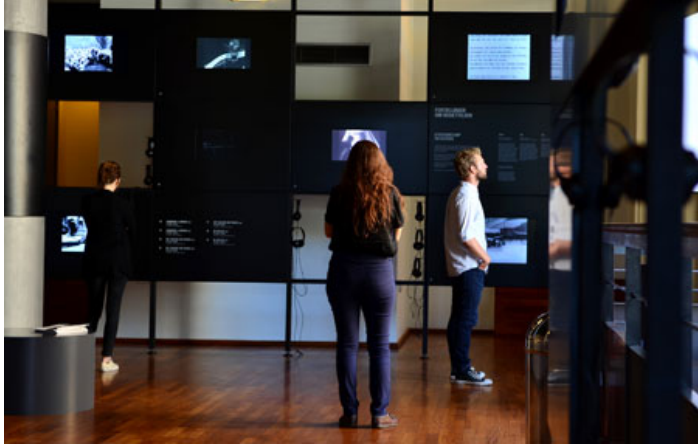
From the exhibition in the Filmhouse.

The Danish Film Institute puts in place the project "Sculpting the Past / Fortid interpreted" film game in a game for a contemporary audience.