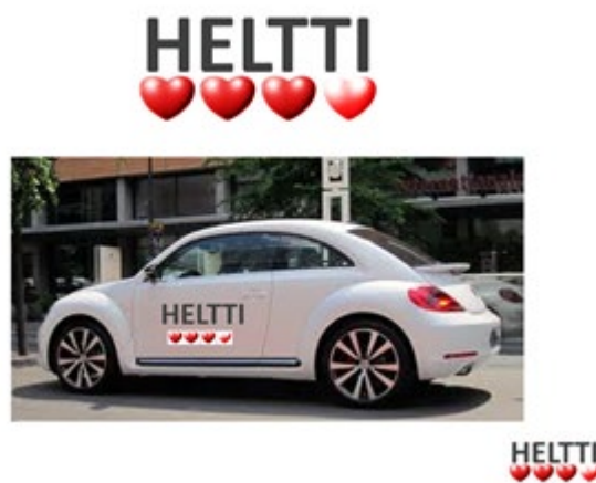
Figure 4 Heltti car (presentation 24.1.2013)