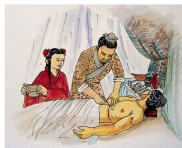
Hua Tuo (145 – 208A.D.) is a famous highly-skilled doctor of the Eastern Han Dynasty in China