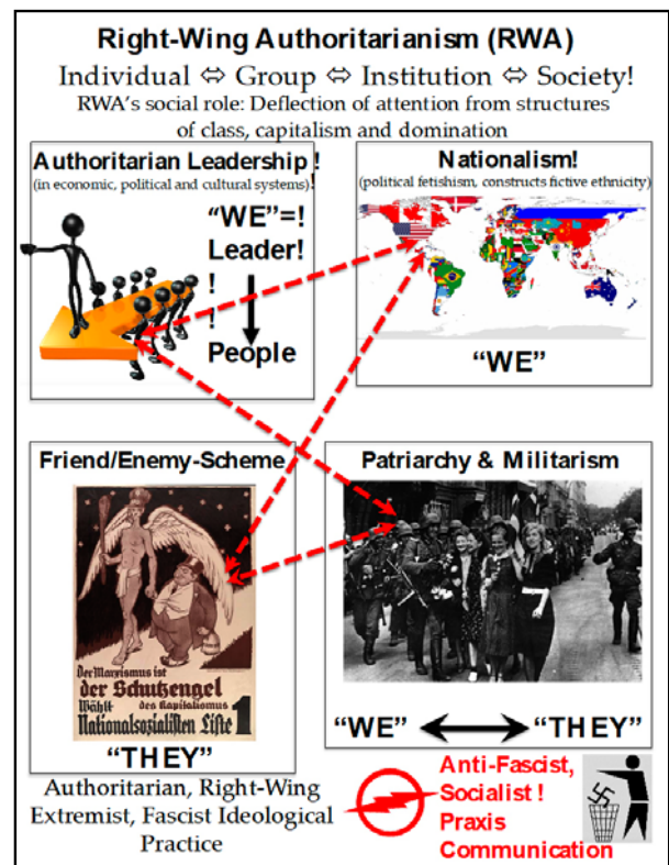
Figure 1: A Model of right-wing authoritarianism

enemy scheme; and militant patriarchy (law and order policies; idealization of warfare and soldiers; repression of constructed enemies; conservative gender relations). RWA serves the ideological purpose of distracting attention from the role of class structures and capitalism as foundations and causes of social problems. Refugees, immigrants, developing nations, Muslims, etc., are constructed as scapegoats who are blamed for problems such as unemployment, low wages, economic stagnation, the decline of public services, the housing crisis, and crime. Trump blames Mexico and China for deindustrialization and social decline without ever mentioning that US capital exploits workers both in the US and in destinations of outsourced capital, including in Chinese sweatshops and Mexican maquiladoras .