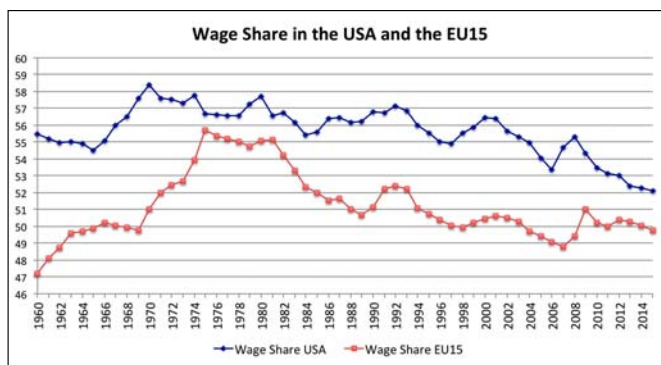
Figure 2: The share of wages in the GDP in the USA and the EU over time

An alternative explanation takes political economy seriously. For this purpose, the approach of critical political theorist Franz L. Neumann in his 1957 essay Anxiety and Politics is helpful. The rise of right-wing authoritarianism according to this explanation has to do with the alienation of labor (see Figures 2 and 3); destructive competition; social alienation that creates fear of social decline; political alienation from the political system, politicians, and political parties; and the institutionalization of anxiety by far-right groups that stoke fears and advance the politics of scapegoating.