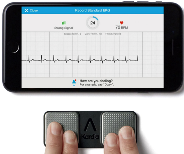
Figure 3 AliveCor Kardia Mobile single-lead handheld ECG (Image used with permission from AliveCor).

between the QRS complexes are regularly spaced. They will then record whether they felt the ECG was normal sinus rhythm (SR), possible AF, unclassified (unreadable or potentially some other arrhythmia) or unreadable (ECG too poor to make any judgement). The clinical pharmacist will also have space to write any additional comments about the ECG or the patient.