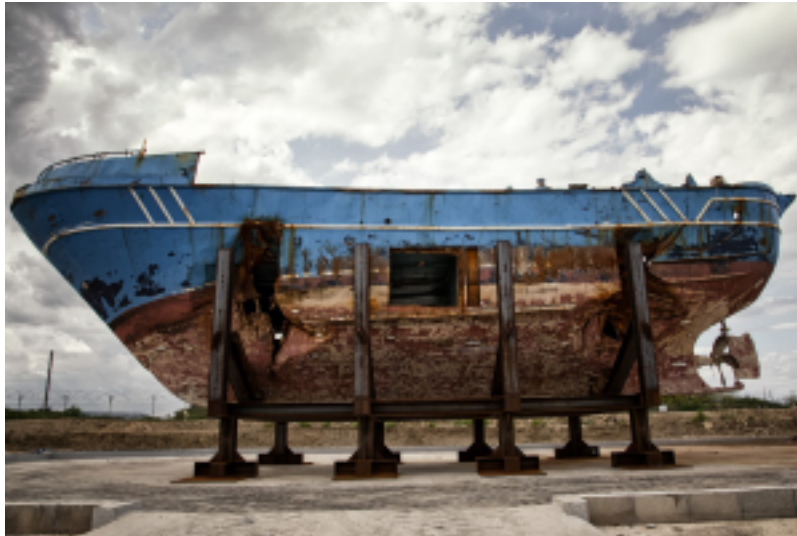
Figure 3: Max Hirzel, The wreck of the ‘boat of innocents’ at the Nato base in Melilli, Sicily. The boat capsized off the coast of Libya on 18 April 2015. Reproduced with permission from the artist

Hirzel’s project also has another function, which is to show the many similarities between the reception of migrants arriving on boats and the management of their corpses—both surrounded by codes, lines, numbers, suits and masks. Hirzel’s project shows how the management of migrant death that has generated a dynamic business—people building anonymous metallic coffins, people driving refrigerator trucks, people piling up wooden coffins and numbering them, etc.—has been normalised, and should be seen as yet another expression of the uncontested history of asymmetrical relations of power. Hirzel interrogates “the normative frames that cast some lives as waste, bogus, and non-human.” [37]