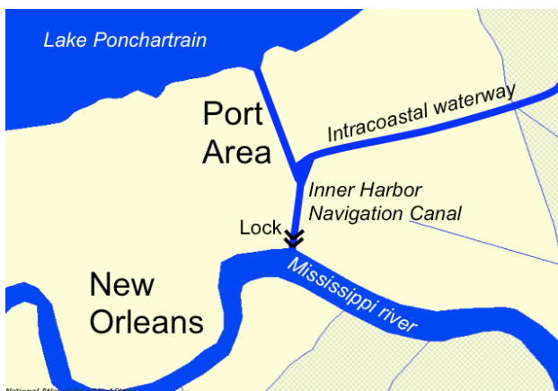
Figure 3: Inner Harbor Navigation Canal in New Orleans

The Inner Harbor Navigation Canal (IHNC) is the official name of the 9 km canal connecting the Mississippi river to Lake Ponchartrain (see figure 3). The canal is often referred to as the Industrial Canal, and indeed serves the industry along its embankments. The Intracoastal Waterway bisects the canal and connects it to Lake Borgne. At the canal's south entrance, the Industrial Canal Lock provides a connection with the Mississippi River. The lock dates back to the 1920s and has become a bottleneck in the system both in terms of capacity and size. The pushing convoys sailing the Mississippi need to break down their convoys to get through. A larger lock could also serve a larger part of the world's ocean- going fleet in terms of size. This is particularly interesting, as the industry along the canal has direct access to a class I railway, a unique feature in the area. A class I railway connection allows competition between railway firms on those tracks which is a highly favourable situation for the industry along the canal. Most other ports in the region, which are connected to the railway system, either lack a deep draft facility, or lack competition on the railways for hinterland transport.