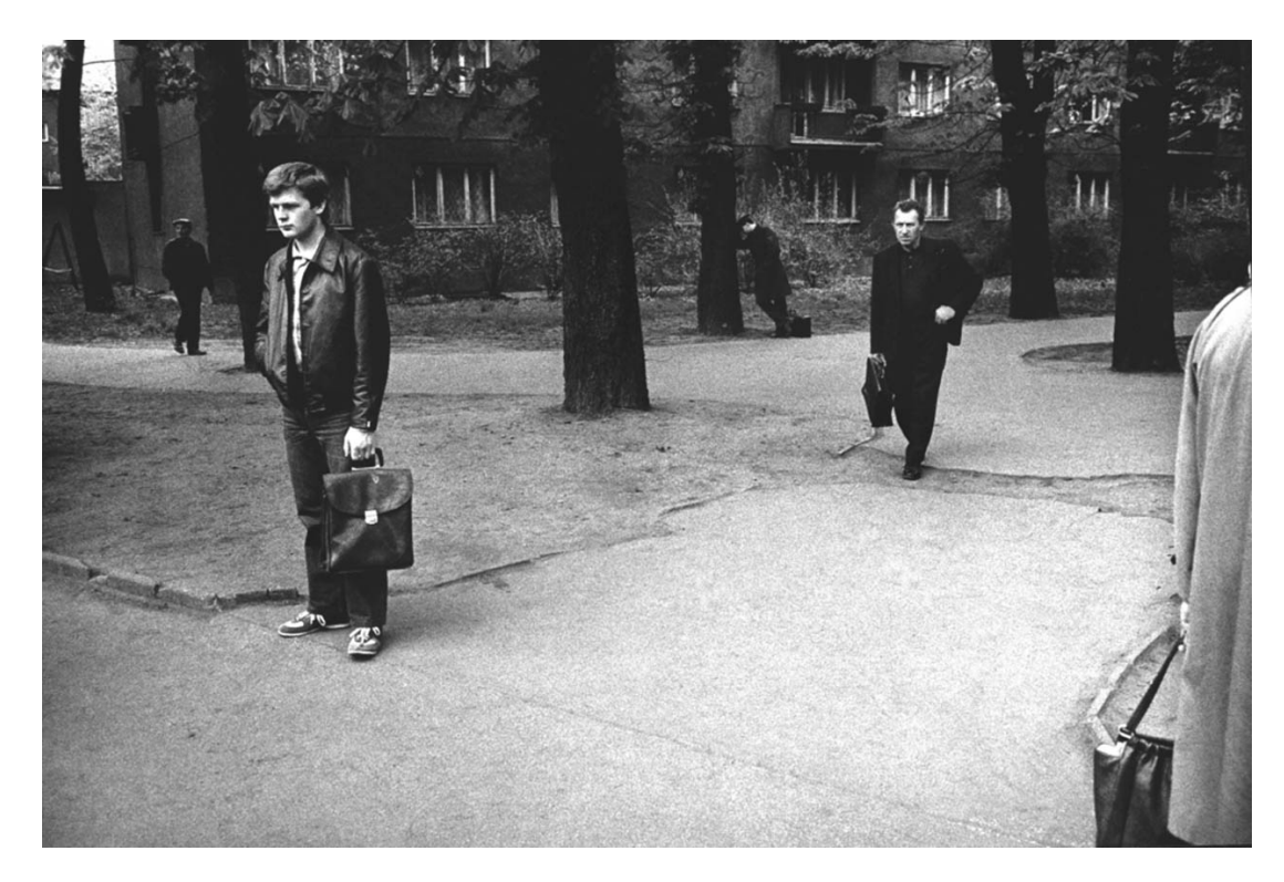
F1. 'Untitled', from the series Ostrava, 1984.