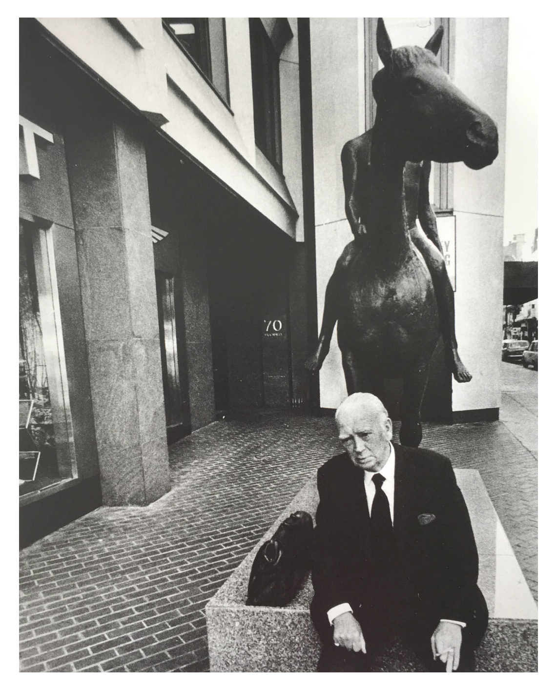
F5. 'London', from the series Sleepers, 1976.