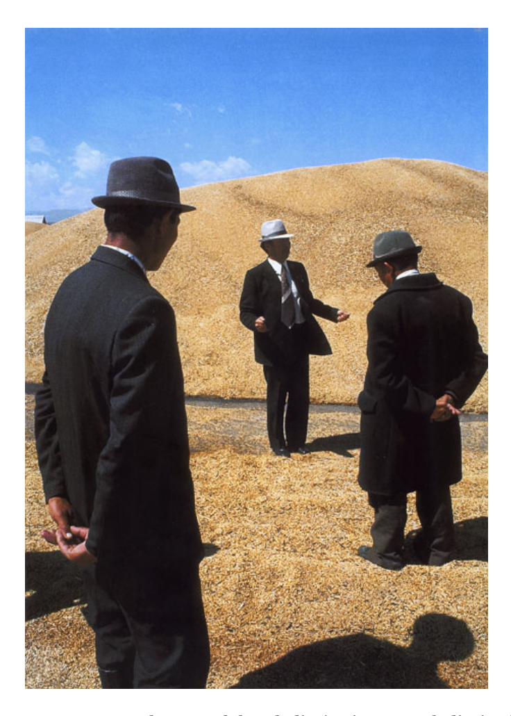
F7. Kyrgyzstan, 1981.

relevance with the forms and volumes of objects depicted (F7). This chromatic experience removes every trace of narrative from his work, it dominates the image, setting up the psychological mood of each scene from an abstract perspective. The different tonalities immerse the sitters in a world filled with confusion and disorientation, which pushes them further away from reality and leaves the viewer wondering about the 'probability' of such visual effect.