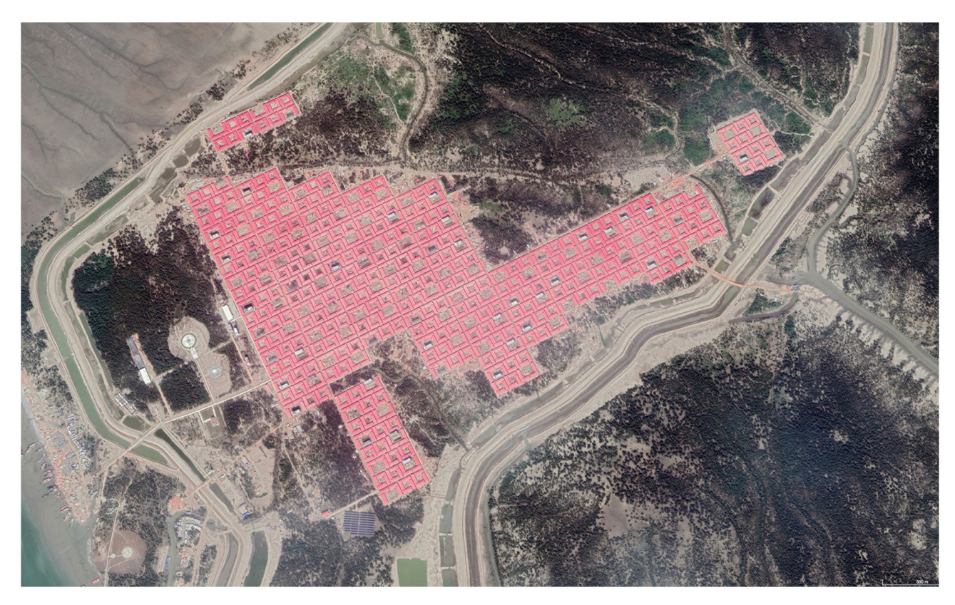
Fig. 4. Satellite image of Bhasan Char in April 2019.

question in Suvendrini Perera's Australia and the Insular Imagination (Perera, 2009, p. 1) "What if the ground beneath our feet turns out to be the sea?" While her question was aimed at a critique of Australian exceptionalism, it could equally be used to question the potential consequences of the incarceration of stateless refugees on a floating platform of sediment in the sea, where they would be in the direct path of cyclones and storm surges and where there was little evidence that human life could be sustained (Ferrie, 2018; Paul et al., 2018).