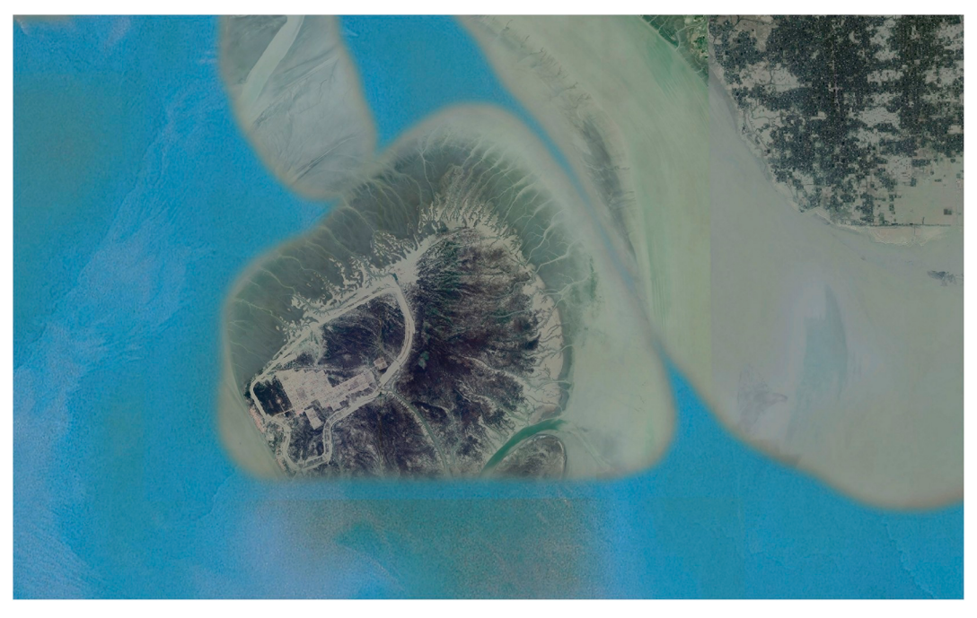
Fig. 3. Satellite image of Bhasan Char in July 2018.

The video confirmed a number of things. Firstly, it confirmed Bhasan Char's isolation - no other landforms are visible on the horizon throughout the video. Secondly, it confirmed that the facility's purpose was detentive. Its dense mat of cellular housing blocks, encircling embankment and the ocean do not suggest infrastructure conducive to civilian life, but rather the kinds of infrastructure associated with incarceration. Thirdly and most significant for the argument in this paper, it confirmed that Bhasan Char was "hardly an island at all" (Yanofsky & Lahiri, 2017a), but rather a shifting, accumulation of terraqueous matter-energy in the process of being stabilised by mangroves, but whose surface had barely emerged from the sea. Its measure was more bathymetric than topographic. Questions of detention became entangled with questions of currents, tides, winds and waves. The video confirmed that the refugees were to be relocated into a sea of geo-hydro uncertainty, where their statelessness (denial of jus soli) would be matched by material groundlessness. It reminded me of the opening