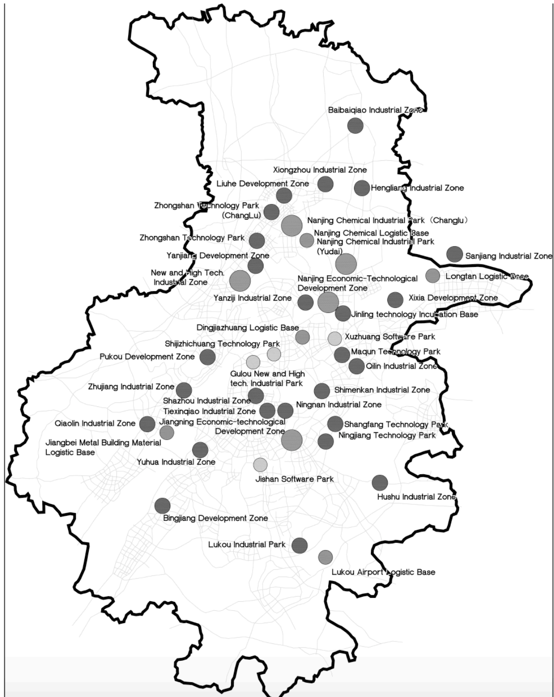
Figure 2. Dispersed industrial zones and parks in Nanjing. (Note: The status of the zones ranges from national industrial zones to town/district industrial zones). Source: Qian, 2013. p.83

In China's development, park fever and zone fever have been accompanied by administrative restructuring, a process in which central cities take over suburban land through annexing counties or towns. Nanjing is no exception. In the years 2000 and 2002, the city went through urban restructuring twice, which enlarged the city proper from 975 km 2 to 4720 km 2 . In this process, the construction of parks and zones co-occurred with the development of university towns, resulting in a government-led coexistence of high-tech grounds and academic fields. Showing Nanjing's ambition to be known as an innovation hub