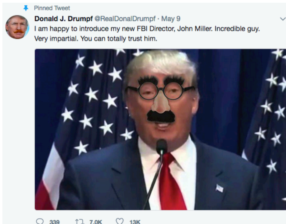
Figure 3: Tweet by @RealDonalDrumpf

Consider the following two examples. Figure 3 is a humorous comment on Trump’s firing of FBI Director James Comey, figure 4 suggests that Trump may just like Richard Nixon face impeachment. Meme and social media culture is in such cases turned into a left-wing strategy. For characterising such strategies, we do not need the term left populism, but can rather speak of left cultural politics or critical cultural politics. The term left populism in contrast risks association with a politics that is nationalist or xenophobic, does everything necessary and does not shy away from any tactic in order to appeal to as many people as possible.