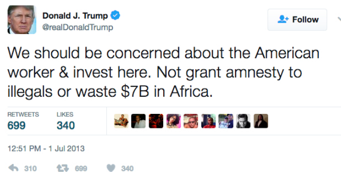
Figure 2: Tweet by Donald Trump, example 2

In a nationalist manner, Trump communicates the need to “make America great again”. National greatness is said to have come under threat by illegal immigrants, Africans, transfer of taxes to foreigners, and development aid. Americanness and the American interest are identified with the American working class, while un-Americanness is identified with immigrants and the developing world.