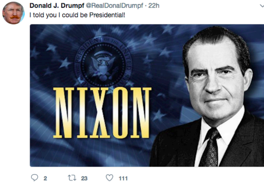
Figure 4: Tweet by @RealDonalDrumpf

However, it is also the task of the intellectual in the difficult times we live in to be a critical, public intellectual who practices a critical, public social science. Franz L. Neumann, who as a Jewish socialist intellectual had to flee from Nazi-Germany to Britain and the USA, and who perfectly understood right-wing authoritarianism like only few others did, has brought this task of a critical public sociology to the point in his essay Anxiety and Politics (Neumann 2017/1957, 629):