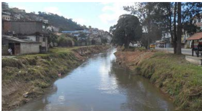
Figure 1: Looking north, the straightened River Bengalas in Nova Friburgo, 2013, with the homes of Rua Ferroviária on its western bank.

It can thus be argued that, rather than the homes of the Rua Ferroviária lying too close to the river – thus placing them at high risk of serious flood – the inverse is true: the river now lies too close to the homes. While repeated canalisation and alteration of the river course had been taking place in Nova Friburgo's centre since the early days of the settlement, its meanders through this northern end of the city were not removed until the Vargas regime of the 1940s, when it was redirected into a purpose-built canal through the centre of the valley, with the railway (and accompanying houses) to its west (see Figure 1). Industrial and road development followed, with the river eventually pushed close enough to the Rua Ferroviária for its residents to be deemed directly 'at risk'.