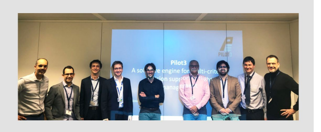
Figure 7. Example of events page in Pilot3 website