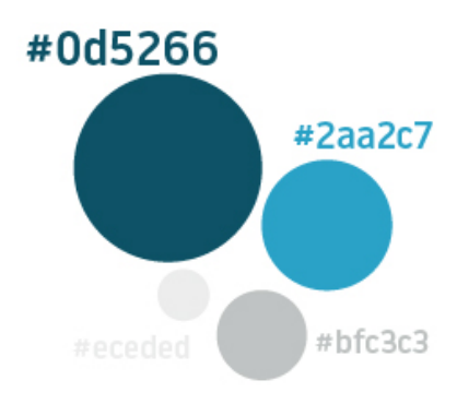
Figure 3. Pilot3 colour palette