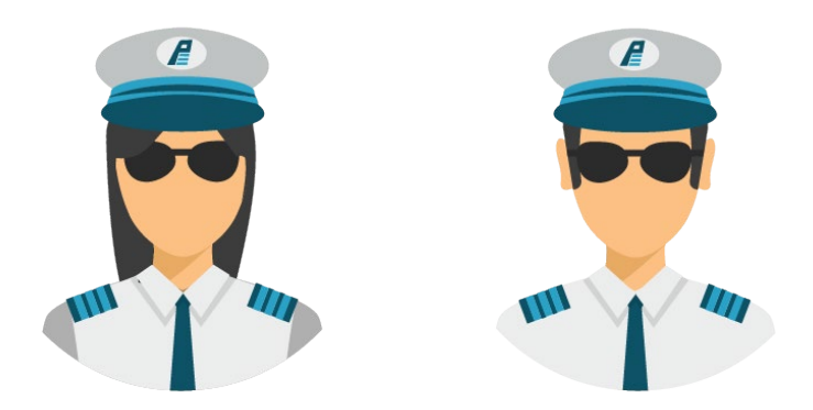
Figure 4. Pilot icons

Two pilot icons were developed in the start of the project, so they could be used along the duration of the project as the main pilot icon when needed, and to go with presentations, blogposts, websites and any communication material where they may be needed. They have been designed as part of the main Pilot3 image materials, together with the logo. A female and a male version where designed.