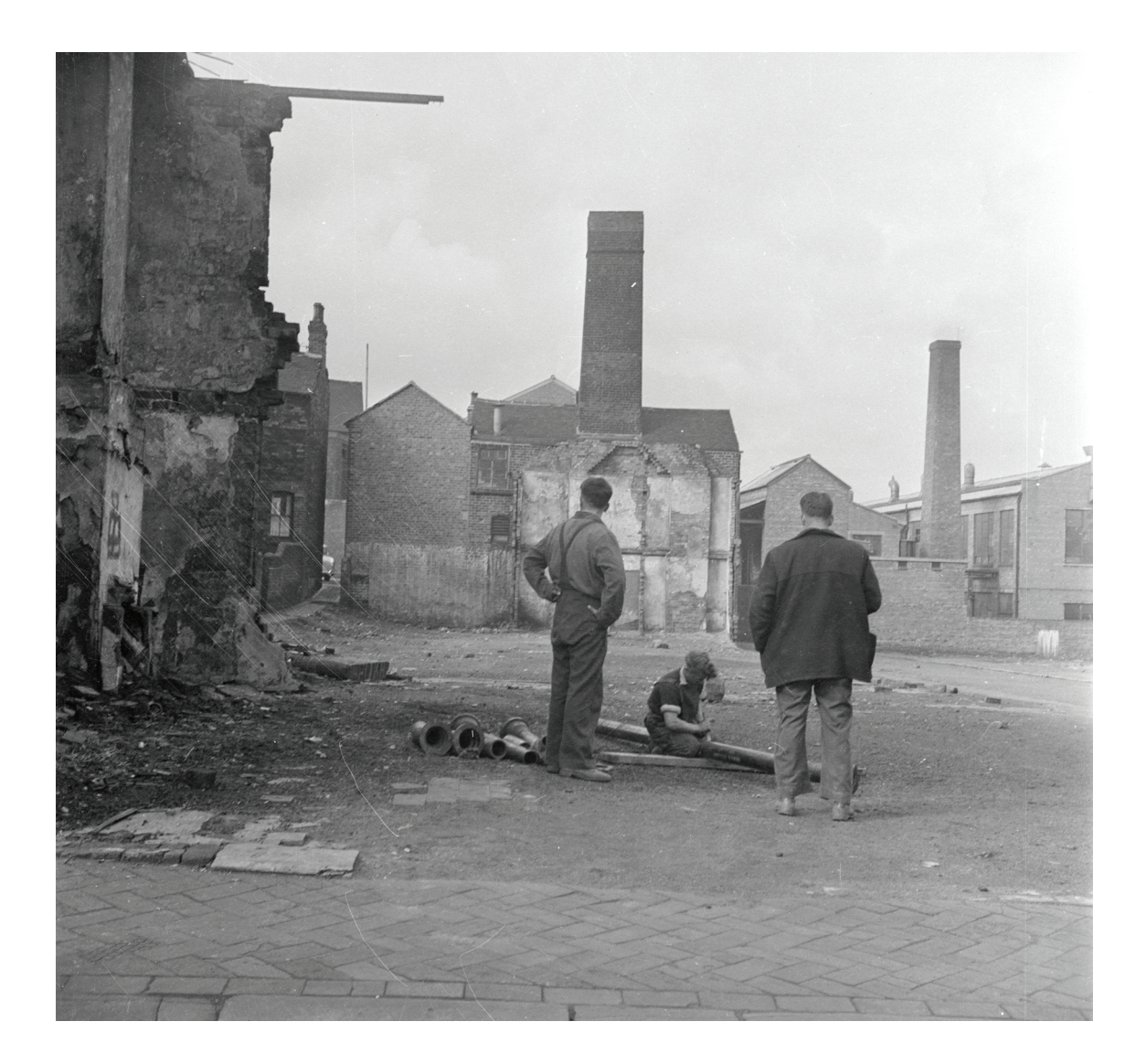
Fig. 8: Nigel Henderson. Photograph showing three unidentified men next to a badly damaged building. Date unknown.