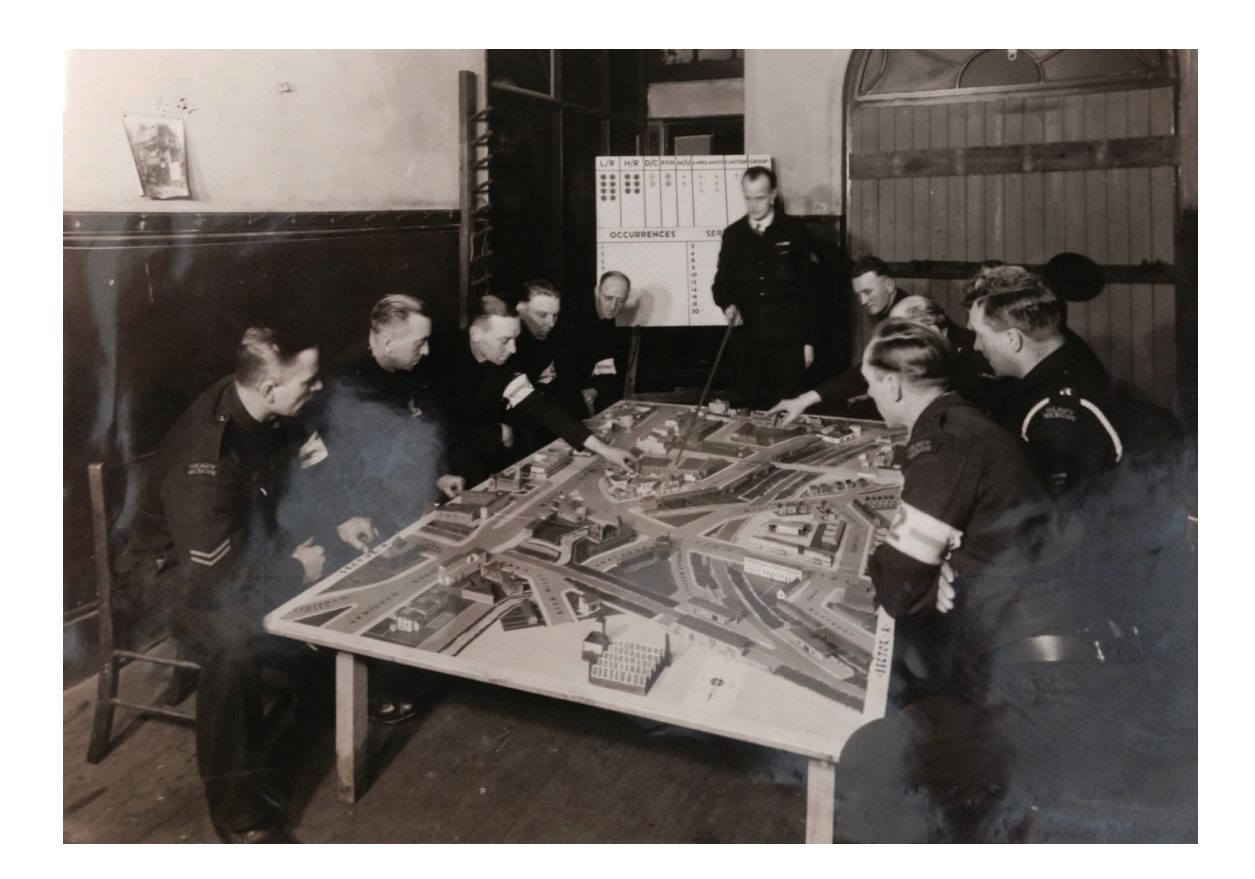
Fig. 6: Rescue Service Officers in Training, 1941. LMA LCC/AR/WAR/1/30, 72010.