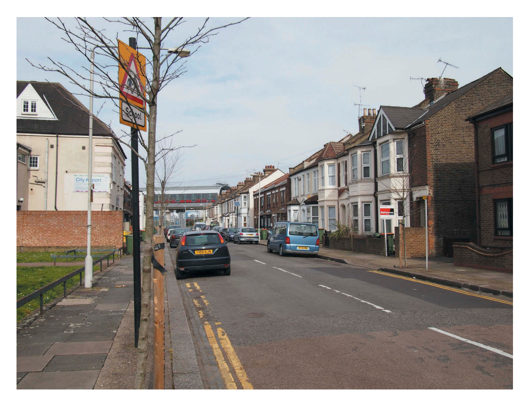
Figure 2. Existing houses in North Woolwich.