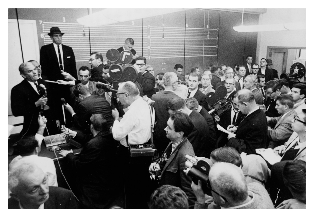
Figure 5.

For instance, Figure 5 above offers just one from the many examples echoing Marco's projection (Google search on August 2017). It narrates the Dallas District Attorney Henry Wade conducting a press conference following the assassination of President Kennedy in 1963.