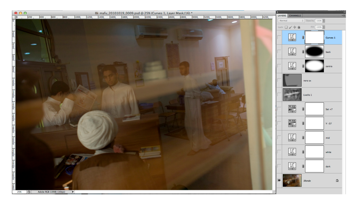
Figure 2. Un-designed photograph.

Visual journalism before (above in Figure 2) and after (below in Figure 3) digital designing of RAW data.