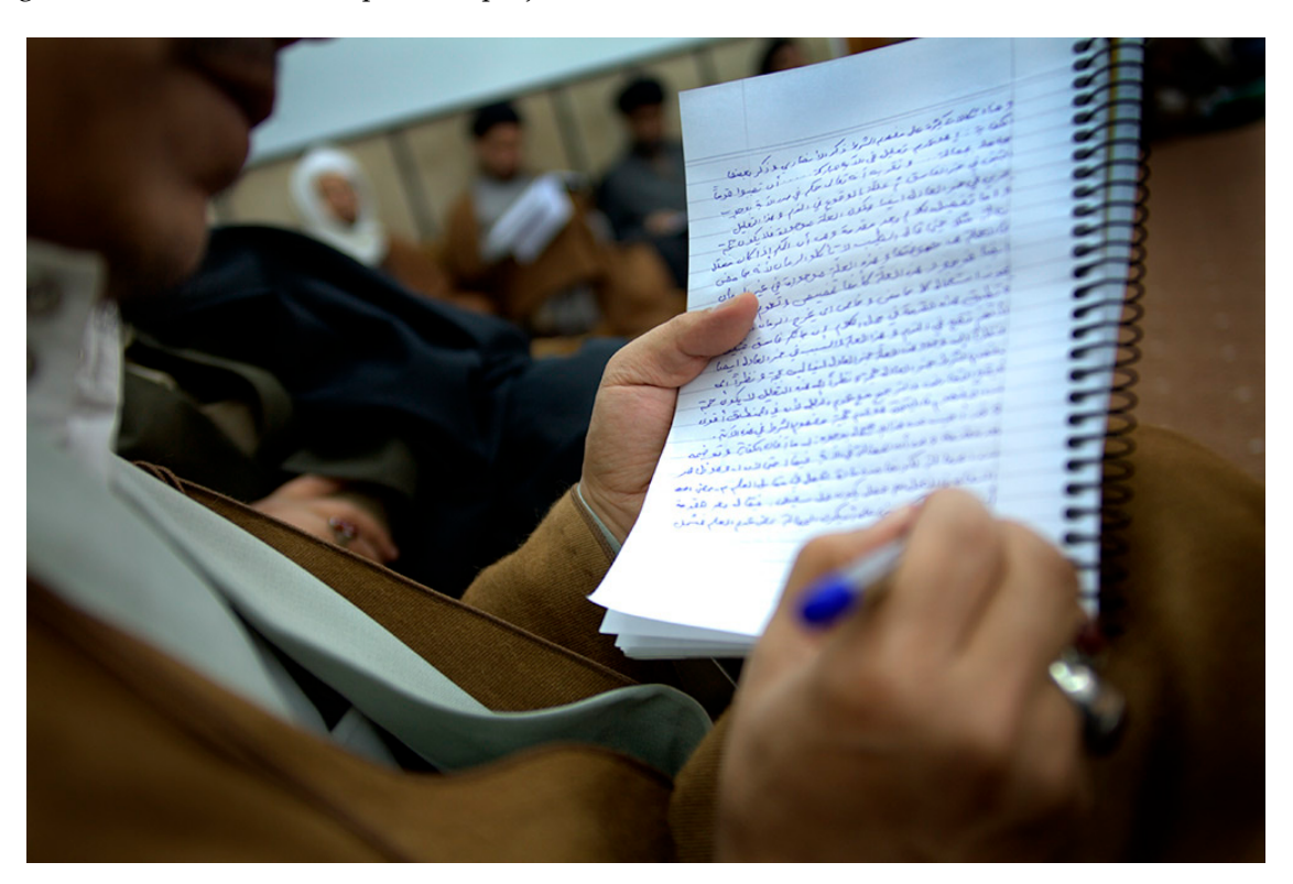
Figure 4. Designed photograph.

Our conversation introduces the extent to which in visual journalism and, by extension, in visual communication, intended meanings might be thoroughly dismissed by audiences' significations in the form of personal projections [17].