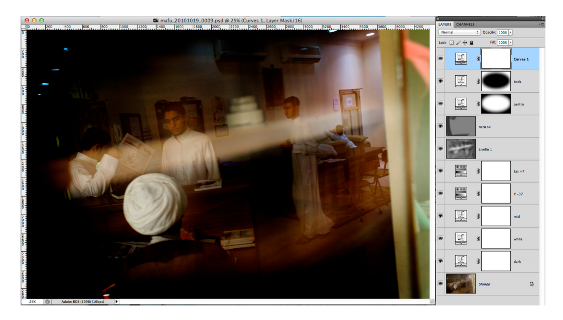
Figure 3. Designed photograph.

As the visual journalist is endlessly framing the signification of the real, they re-design context with a slight movement of the head. By recognising a different communicative rhythm, they "find and focus on (that) particular subject within the mass of reality" [15] (p. 32). With a simple detail, they are capable of creating a thoroughly subjective interpretation. Raising the not unreasonable question, how does one manage the thoroughly personal quality of visual journalism?