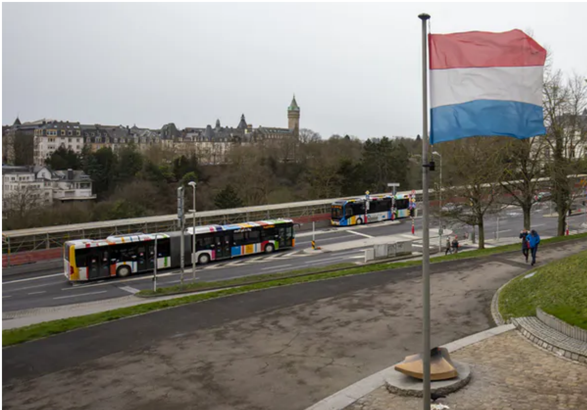
Luxembourg is the first country in the world to abolish public transport fares nationwide.