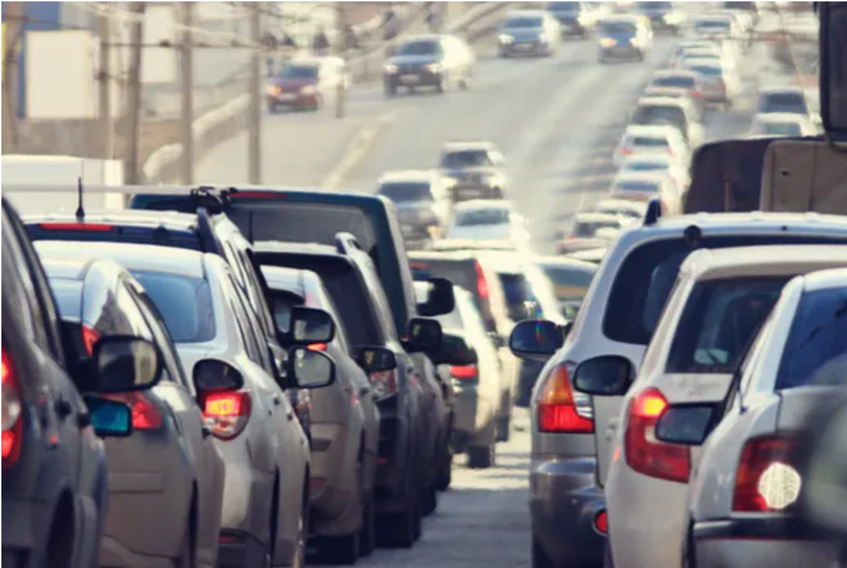
Reducing congestion and air pollution requires fewer cars.

Experts from the Cosmopolis Centre in Brussels agree that the effects of free public transport on car traffic levels are marginal, arguing that by itself free public transport cannot significantly reduce car use and traffic, or improve air quality.