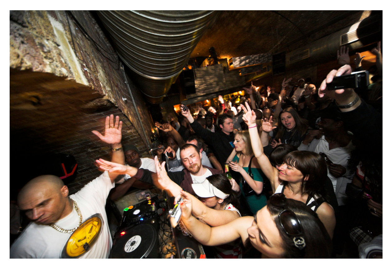
FIGURE 2. GIRL MAKING THE BO! SIGN, AT KEMISTRY MEMORIAL, MAY 2009.

Lemon D has channelled the explosive violence unleashed by the sub-bass gesture into the Amen break, cutting and splicing this sampled rhythm in such a way that the loud snare fragments undermine the dancer's internal sense of a steady 4/4 meter. Together with the impact of the bass accents, the scything, unpredictable snares have the effect of temporarily tearing the ground from beneath the dancer's feet. It is only after extended listening that one can hear patterns emerge; the bass notes occur at regular intervals, providing a structure for what seems like the spontaneous disorder of the sampled snare fragments. They signify the presence of a broader, systemic permanence to this chaos. As such, the ground-level chaos of the post-industrial city, apparently encouraged by official powers, has been shockingly articulated.