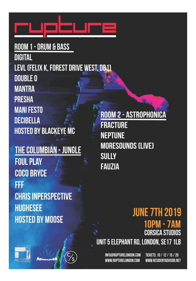
FIGURE 1. RUPTURE FLYER, JUNE 2019.

A sense of permanence and intractability about the city's grim situation is connoted by the line's frequent repetition until, at one minute and forty-five seconds, the melodic layers are unexpectedly removed, leaving an ominous drum roll that builds as the sound of circling police helicopters looms overhead. As the drum roll reaches its peak, Brokaw asks in a paternalistic tone, "let's see if there is anything that can be done about all of this". At this point, a powerful bass drop—characterised by a dull, pumping effect—punctuates the music with a startling forcefulness. This signifies both a challenge to the dancer's sense of the main beat—whose apparent control over the rhythm has been confronted by the sonic violence of the bass and the replacement of the Think break with a series of crashing Amen patterns—and augments the realisation that speed and rupture are inevitable characteristics of post-industrial urban life. The track continues in this vein until its conclusion at six minutes and twelve seconds.