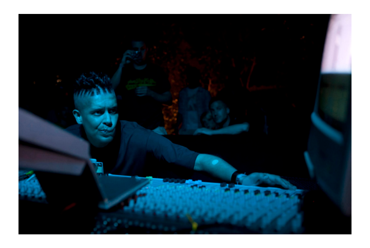
FIGURE 3. PARADOX LIVE AT THE SUN AND BASS FESTIVAL, SARDINIA, SEPTEMBER 2014.

In the context of drum 'n' bass, the authenticity conferred by the return of the break-beat shows the extent to which authenticating notions informed by historical legacies of Black Atlantic musical practice are also shaped by the economic and creative efficacies offered by sampling technologies. On the one hand, the rapid tempos and relative cost-effectiveness of its sample-based digital base indicate that drum 'n' bass developed out of a working class-inflected creative impulse for speed in both its aesthetics and musical production. On the other, its computer-based compositional framework also contains the possibility of lengthening the production process by reassembling break-beats into intricate and lengthy reconfigurations, thereby legitimating drum 'n' bass as a form of art music on the basis of particular producers' virtuosity with computer and sample-based technologies.<sup>10</sup>